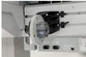
> repositionable scroller support

Depending on your volume and application needs, different optional motorised take-up systems for roll weights up to 30 kg are available. We also offer fully motorised roll-off/take-up systems for rolls up to 80 and 100 kg.