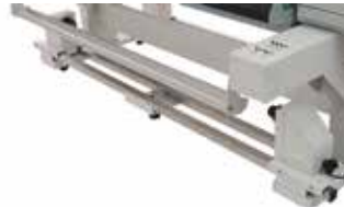
> 80 kg motorised take-up system