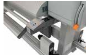
> 100 kg motorised take-up system